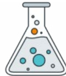
Clinical Trial Finder