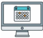
My Amyloidosis Appointment Companion

As part of your MAP experience, you can also find and compare specialty treatment centers and receive personalized matches to clinical trials.