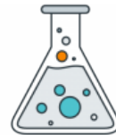
Clinical Trial Finder