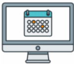
My Amyloidosis Appointment Companion

As part of your MAP experience, you can also find and compare specialty treatment centers and receive personalized matches to clinical trials.